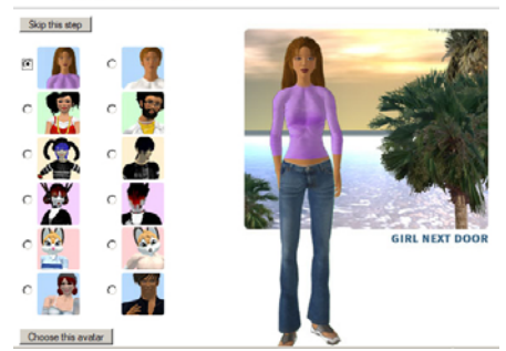
Fig. 5 First set of avatars