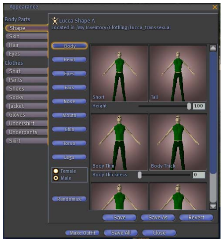
Fig. 8.1 Appearance Editor

Within Second Life, the central tool for modeling the player's virtual character is the 'Appearance Editor' (Fig. 8.1) which offers a lot of options to detail the bodily properties. This tool offers the common gender categories 'male' and 'female', but also allows creating transgender images to a certain extent (Fig. 8.2.; Fig. 8.3).