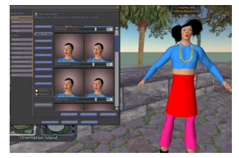
Fig. 8.3 Gender switch male to female