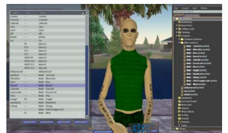
Fig.13.1 Male gesture set

The body language differentiates between male and female gestures which refer to common gender stereotypes. The male gestures set consists of 12 items (Fig. 13.1), while the female gesture set consist of 18 items (Fig. 13.2) consolidating the common sense that women are generally more emotional than men, explicitly articulate their emotions (cry, embarrassed), love to coquet (hey baby), set a high value on their appearance (looking good) than men.