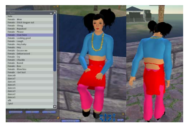
Fig. 13 Female-to-male avatar with unfitting clothes and gestures set

gesture set do not switch accordingly. Moreover, female to male avatars get problems with their clothes which do not