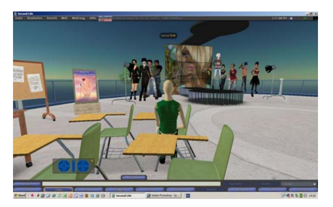
Fig. 2 Interface of Second Life