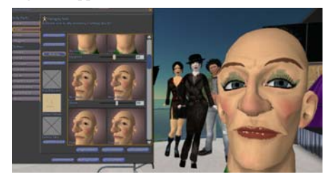
Fig. 8.2 Male avatar with make up