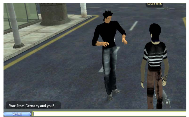
Fig. 17: Marginalization of communication within the graphical environment of SL

appearance of the avatar than by its textual contribution. Communication between avatars is just displayed as little speech bubble at the bottom of the interface which disappears quickly. In this respect, verbal interaction as tool for self expression is inferior to the visual self performance within the dominant graphical environment of Second Life (Fig. 17).