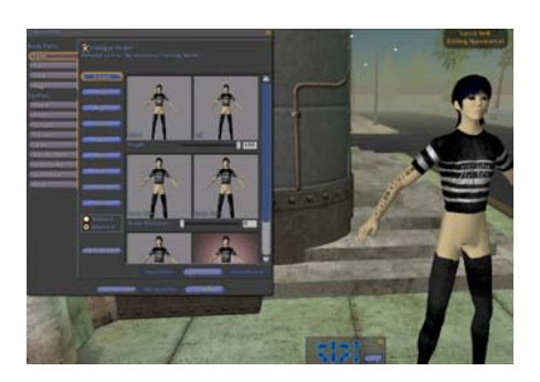
Fig. 12.1 Male avatar without genitals

Second Life first forces their players to decide between male and female avatars (Fig. 5) which later can be individually modified. But the avatars are just males and females on the surface. After undressing them, 'Spivaks' appear (Fig 12.1). Sexual attributes, in this case masculinity can be emphasized or marginalized by the genital area of the trousers (Fig. 12.2., Fig. 12.3).