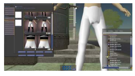
Fig. 12.2 Edit masculinity via trousers (big)