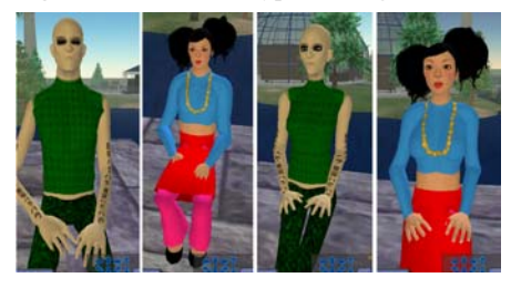
Fig.15.2 Gender stereotype sitting